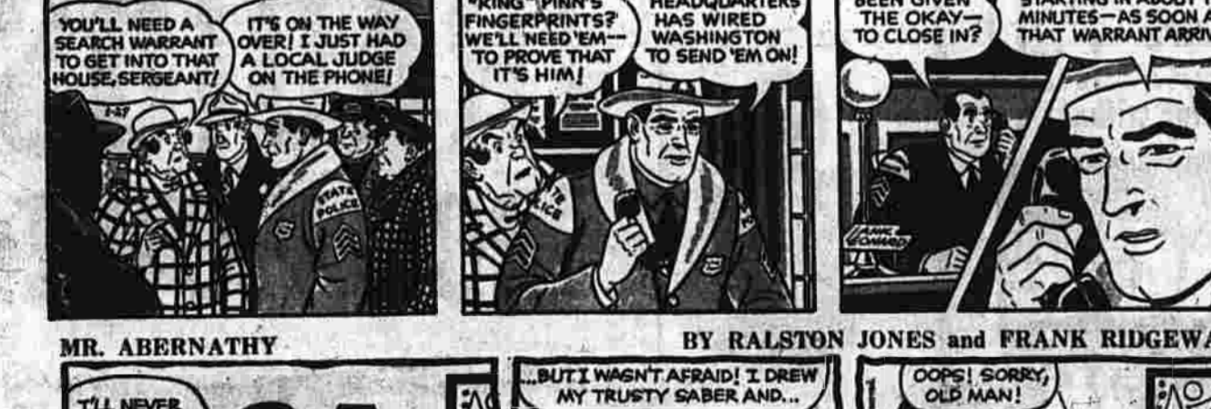
BY LANK LEONARD