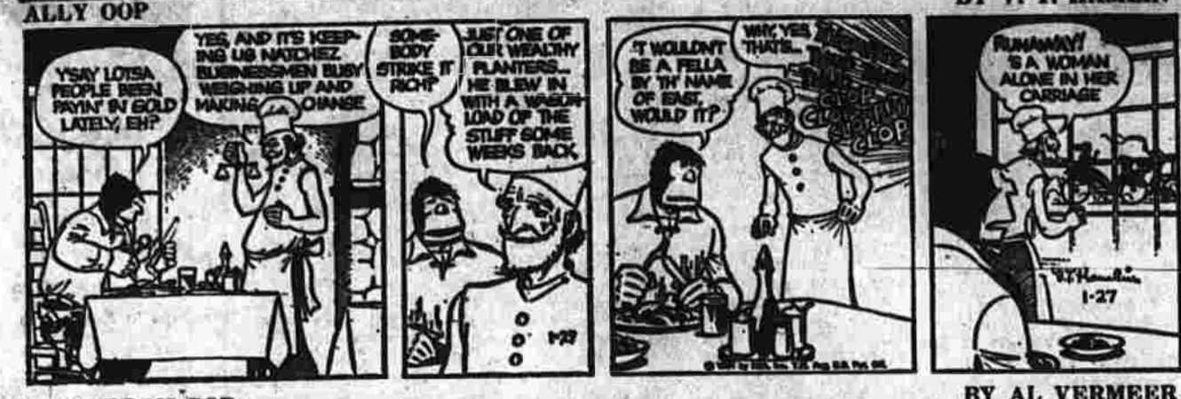
BY V. T. HAMLIN