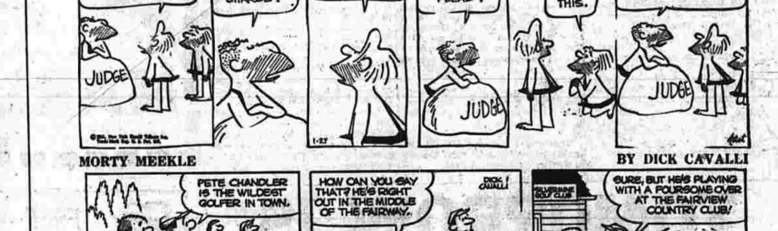
BY JOHNNY HART