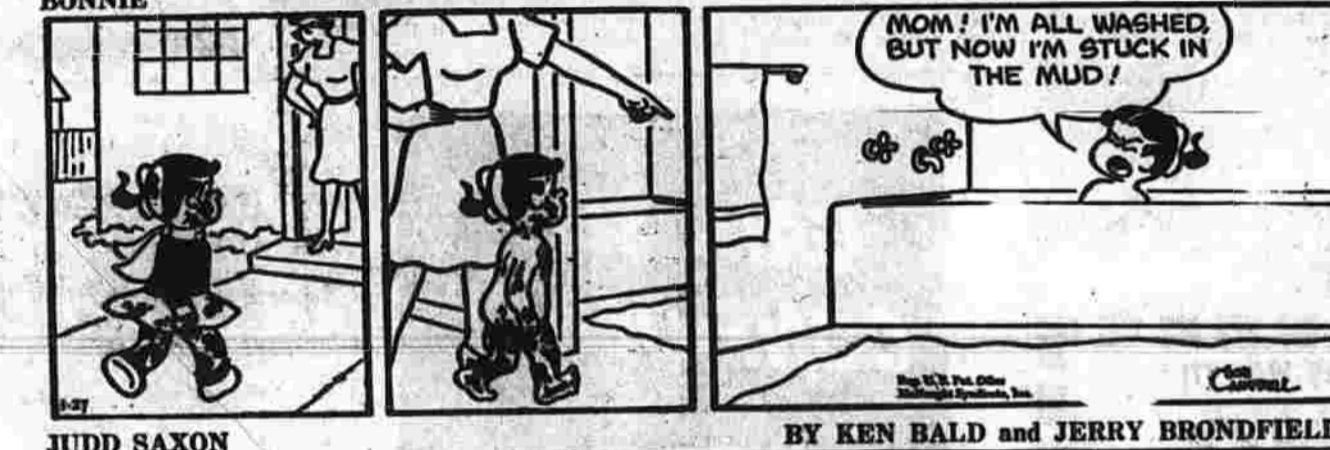
BY JOE CAMPBELL