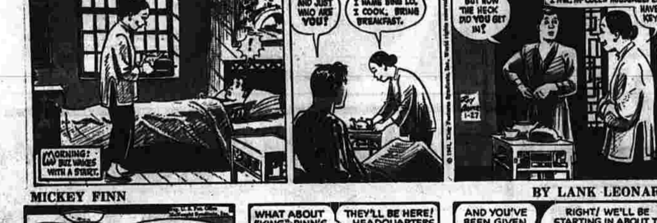
BY ROY CRANE