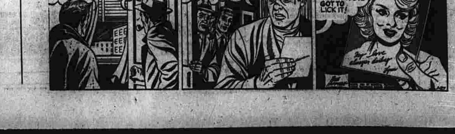
BY PETE HOFFMAN