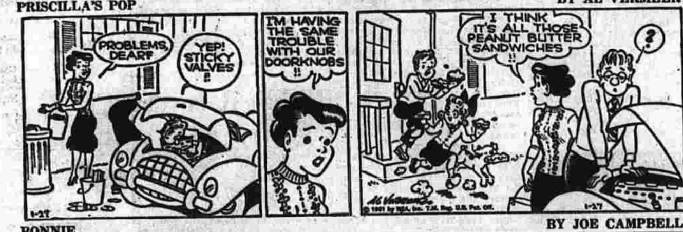
BY AL VERMEER