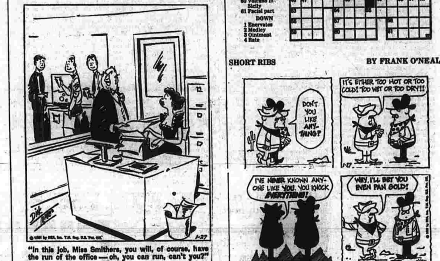
BY FRANK O'NEAL